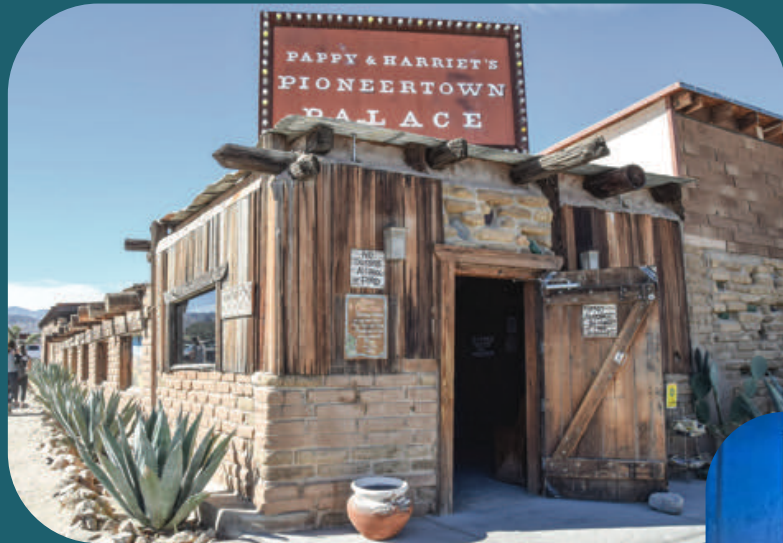
PAPPY + HARRIET'S