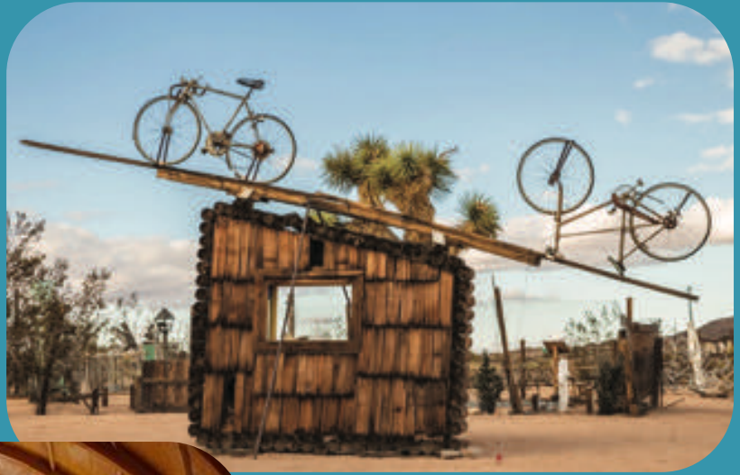
NOAH PURIFORY SCULPTURE GARDEN