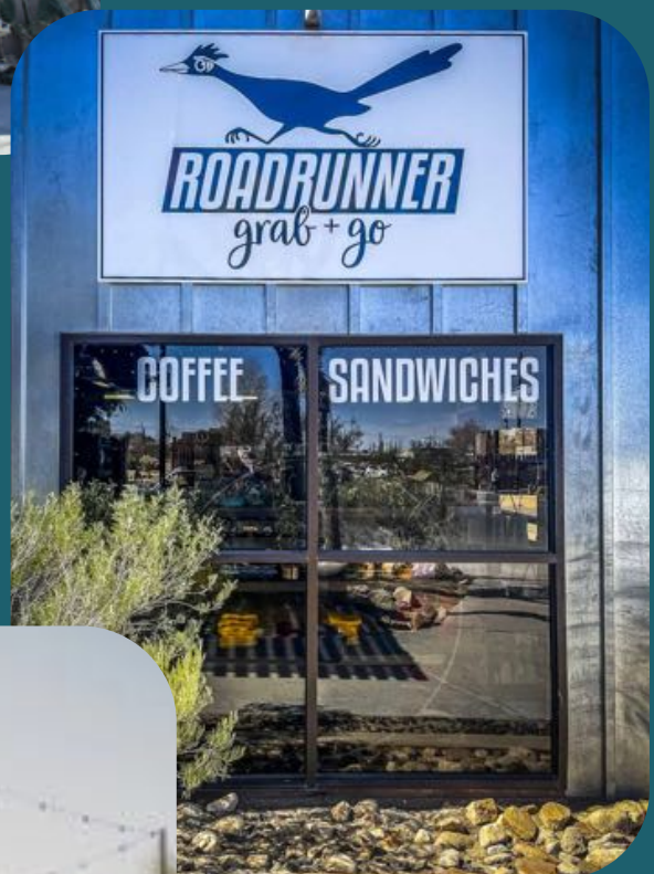
ROADRUNNER GRAB + GO