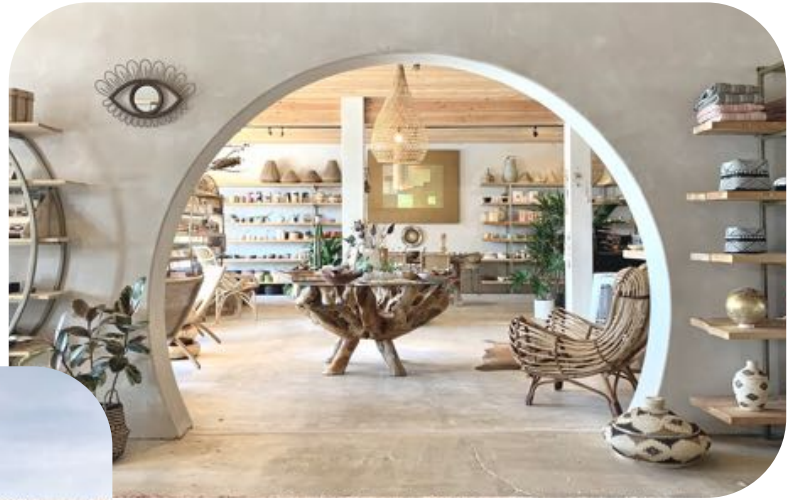
ACME 5 LIFESTYLE