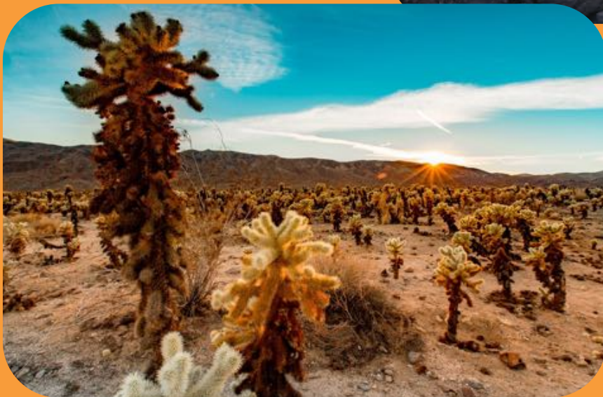
CHOLLA CACTUS GARDEN