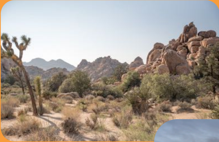
HIDDEN VALLEY NATURE TRAIL